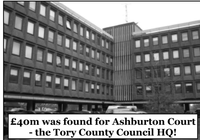
£40m was found for Ashburton Court - the Tory County Council HQ!

Local Tory priorities are totally wrong! £40m was found to do up their Winchester ivory tower. Yet residential care homes are closing! Four have already gone. Caring for our most vulnerable should be a top priority in any civilised society.