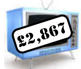
PHONE AND CABLE TV