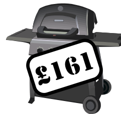
BARBECUE & GARDEN CHAIRS