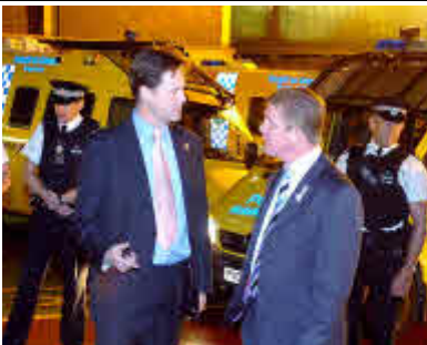
Nick listens to ordinary people. He will lead the Liberal Democrats to make Britain a better place for all of us.