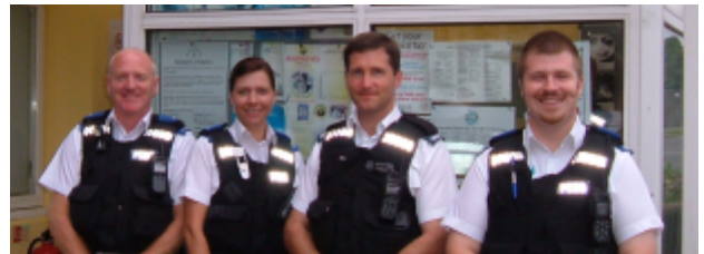
North Farnborough PCSO and Police team

Following a complaint to police about young people hanging around alleyways near Water Lane, police noted suspicious activities going on. After a short time arrests were made of people dealing drugs. We await the result of the prosecution.