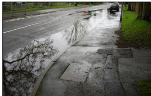
Flooding every time it rains heavily in Ship Lane