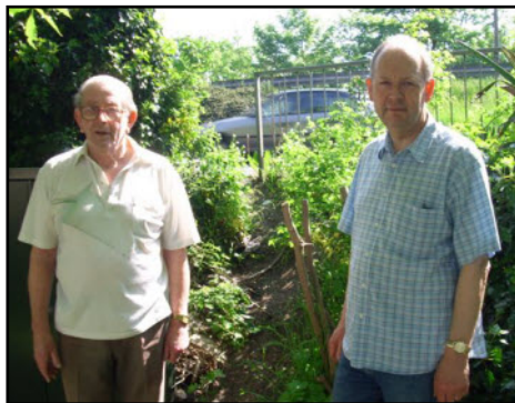
Hedges removed in Buckland Close