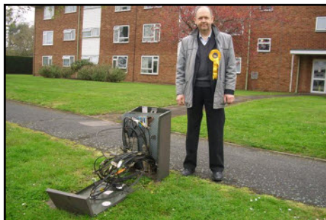
Street crime and vandalism

Are they slow, incompetent or indifferent?