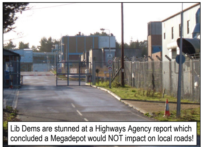
Lib Dems are stunned at a Highways Agency report which concluded a Megadepot would NOT impact on local roads!

Lib Dem-run Blackwater & Hawley Town Council have pledged £500 towards SPLAT's legal funds but Conservative-run Rushmoor Council have said that it will not be contributing.