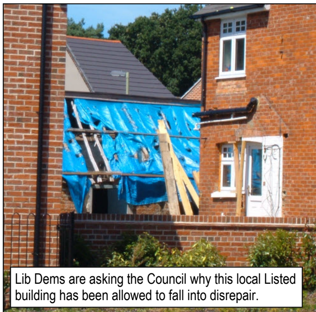
Lib Dems are asking the Council why this local Listed building has been allowed to fall into disrepair.

Rushmoor Lib Dems are asking why a local Grade 2 Listed Building has been allowed to fall into disrepair.