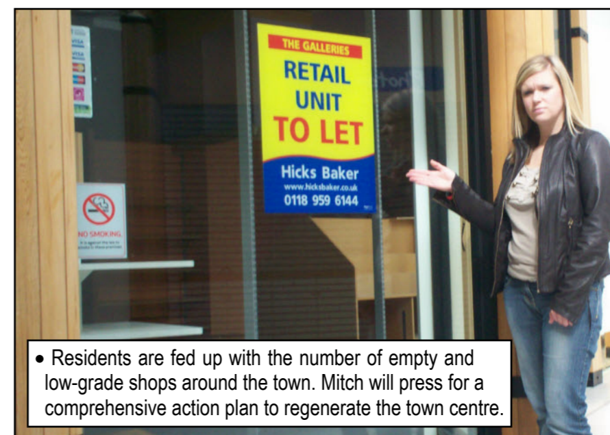
Residents are fed up with the number of empty and low-grade shops around the town. Mitch will press for a comprehensive action plan to regenerate the town centre.

Mitch's survey has revealed widespread dissatisfaction with Tory-run Rushmoor Council.