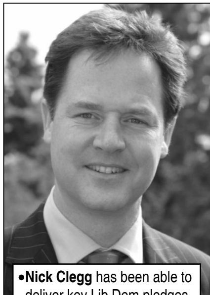
Nick Clegg has been able to deliver key Lib Dem pledges.

We promised to make tax fairer, and now we are delivering: