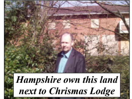
Hampshire own this land next to Christmas Lodge

Clearly the Conservatives believe that having a comfortable time in their Winchester Ivory Tower is more important than looking after vulnerable people.