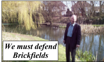
We must defend Brickfields

So if they decide to sell Christmas Lodge for development such as housing, we need to be certain that this vital part of the Country Park is retained in local authority ownership.