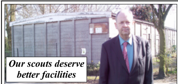
Our scouts deserve better facilities