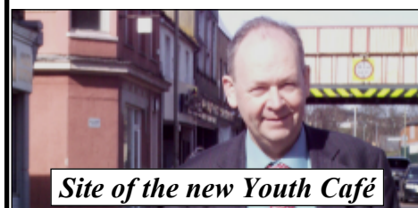
Site of the new Youth Café

The Mountain Bike and Skateboard facility in Manor Park is great. What else do our young people need?