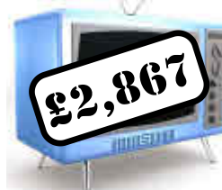
PHONE AND CABLE TV