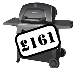
BARBECUE & GARDEN CHAIRS